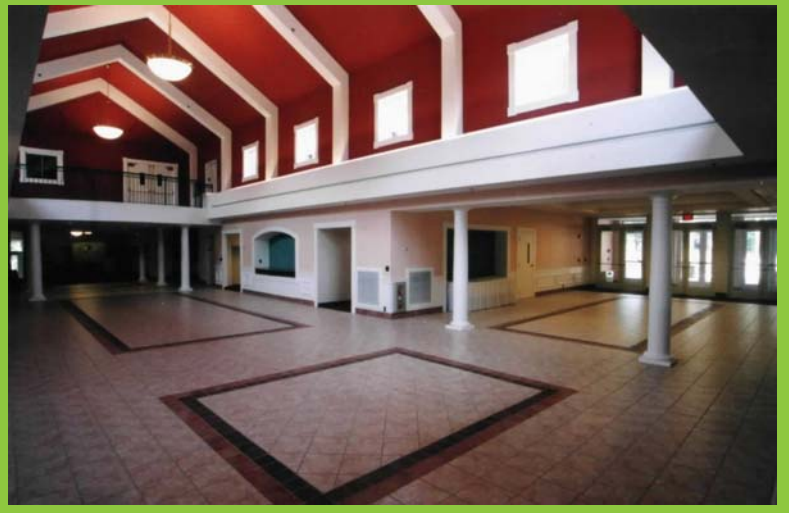
Pearce Memorial Church North Chili NY

A trend we have been seeing is the enhancement of an established congregation's facility for fellowship. Historically, many churches get started by building a sanctuary and minor support spaces. As the congregation grows and matures the addition of a "fellowship style" narthex, multipurpose spaces, and weather appropriate entries are required to enhance the congregation's interaction.